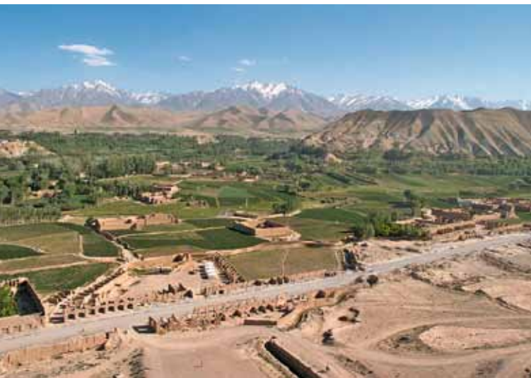
View of the cultural landscape of the Bamiyan Valley, in the foreground the old bazaar

the geological and rock-magnetic characteristics has not yet been completed. In the matter of the so far unsolved critical question of stabilising the stone fragments, which are extremely fragile and under the influence of humidity dissolve into sand (even simple lifting is dangerous) a breakthrough could be achieved: The only appropriate procedure for stabilising the fragments appears to be the total impregnation with silica acid ester (KSE) in a vacuum chamber, a newly developed method that has been successfully tested by the team of Prof. Erwin Emmerling. Semi-permanent shelters for the Western Buddha fragments (task 4) are now available after the erection of an additional hall for the salvaged fragments. A permanent crane in the Eastern Buddha niche for maintenance/conservation access was planned in the form of a very simple and reversible solution. Edmund Melzl, restorer in the ICOMOS team, investigated the state of the Kakrak Buddha niche (task 6). Finally in 2010, by request of the local inhabitants two ruinous Islamic mausoleums (Jafa Bieg and Khoschkharid Bieg) on the plain in front of the Western Buddha were restored. All these tasks were part of the step-by-step