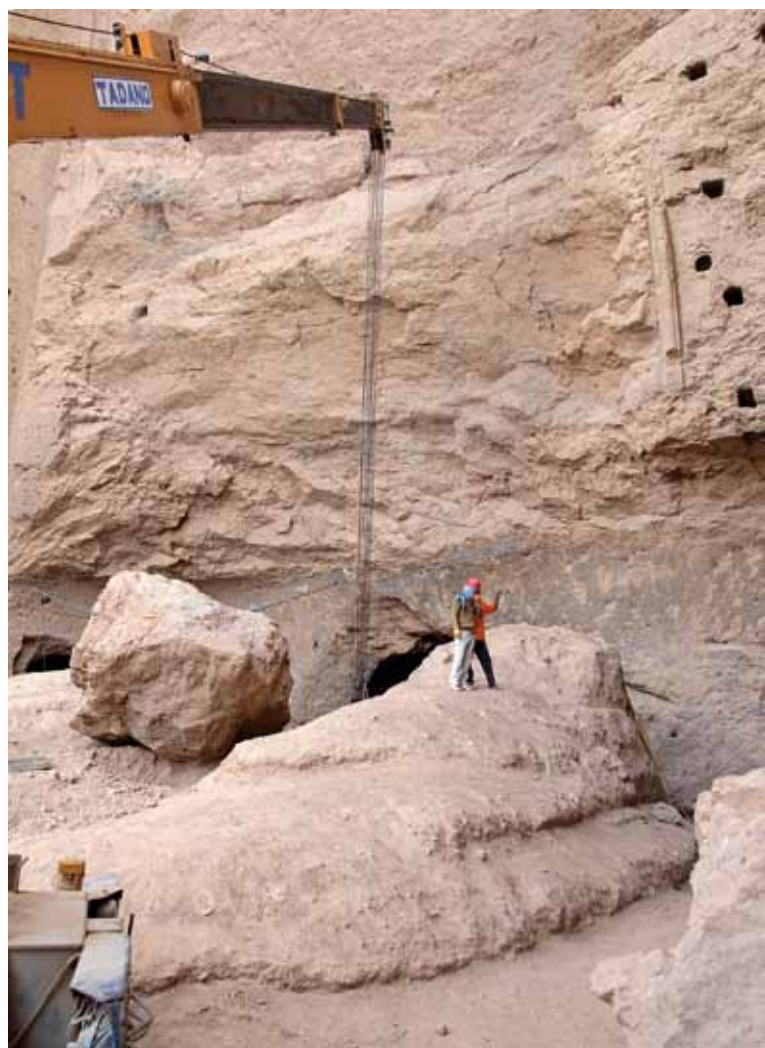
Removal of rock fragments near the uncovered feet of the Western Buddha

In the year 2008, the ICOMOS activities in Bamiyan could not start before mid-August. Under these circumstances, it was not yet possible to complete the upper part of the scaffold, generously made available by the Messerschmitt Foundation, in the Small Buddha niche. Nonetheless, the scaffold proved its worth for the work of restorer Bert Praxenthaler to safeguard the remaining plaster fragments of the Small Buddha. The team of local workmen was primarily employed to salvage stone fragments from the area of the Western Buddha. A decisive progress was made by reconstructing the partition walls of the rearward caves, completely destroyed by