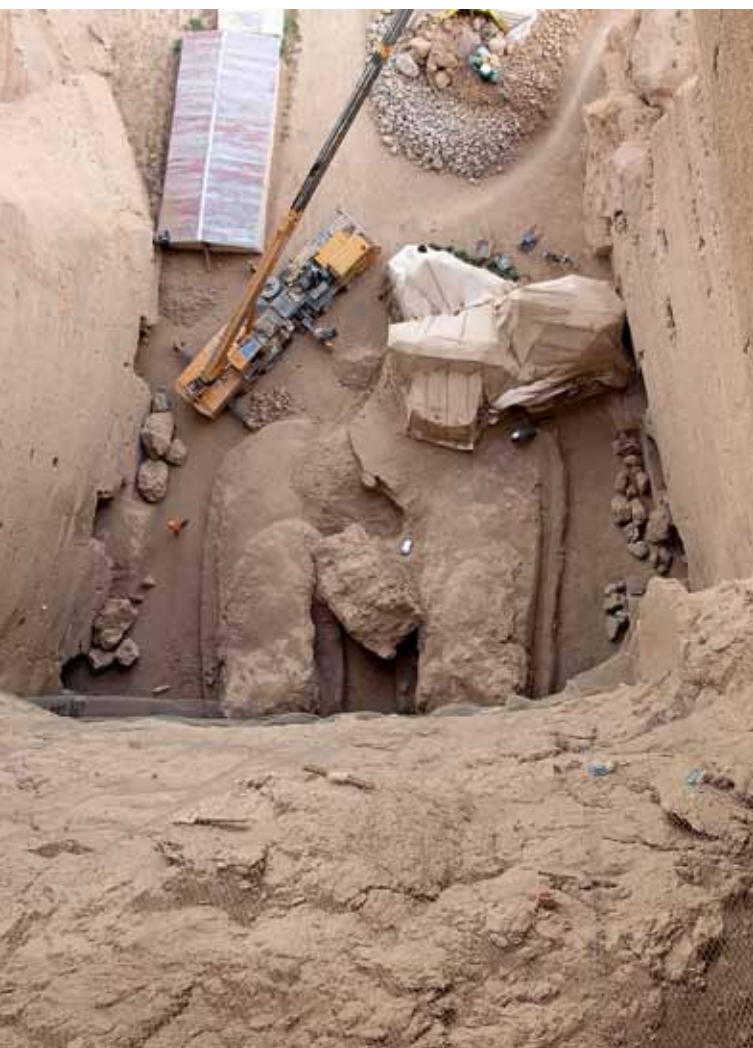
The feet of the Western Buddha, seen from above

2000 cubic metres of fragments have been recovered; not only sand and hopelessly deteriorated stone fragments, as was assumed immediately after the disaster, but identifiable small and large fragments weighing up to 60 tons. In the meantime, most of the fragments are documented and stored in shelters to protect them against weathering. The giant feet of the 55-metre Great Buddha (Western Buddha) are once again visible, and the blocked caves in the backward part of both niches are again accessible. The back wall of the completely scaffolded niche of the 38-metre Small Buddha (Eastern Buddha) with original remains in situ is stabilised. This niche and the associated galleries will even be presented to the public soon as a small site museum together with an exhibition of fragments in the partly reconstructed lower caves. Besides, thousands of plaster fragments from the surfaces of both statues were recovered and from the scientific investigation of these and other remains a wealth of scientific insights was gained, helping to date the statues to the period between the mid-6th to the early 7th centuries AD.