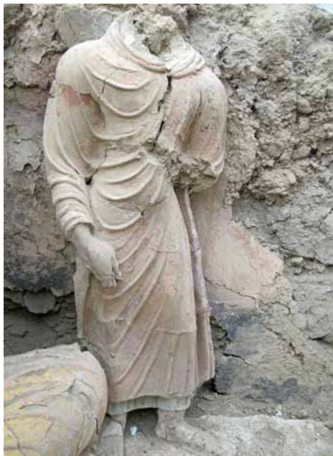
Figurine en argile

mesure d'être relevé, mais avant de vraiment entreprendre les travaux d'exploitation de la mine il reste un deuxième défi à relever : c'est celui de l'archéologie.