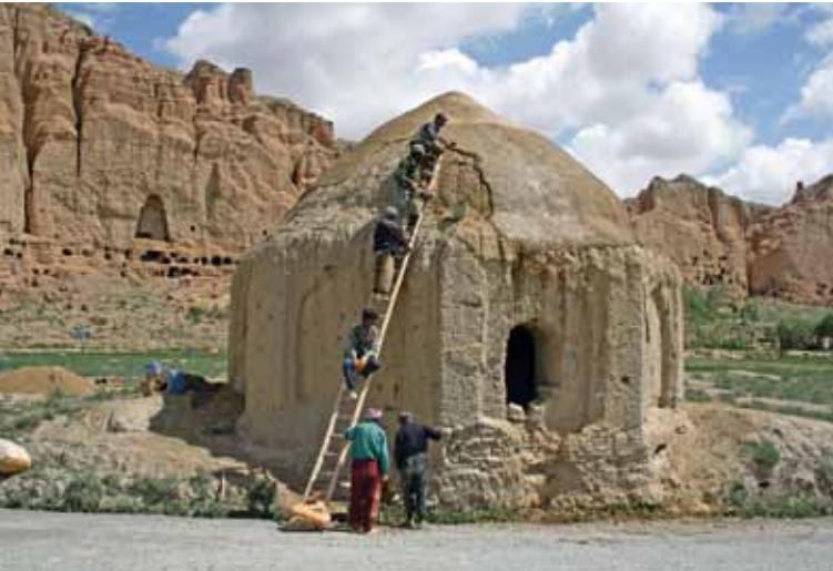
Repair of an Islamic mausoleum on the plain in front of the cliff