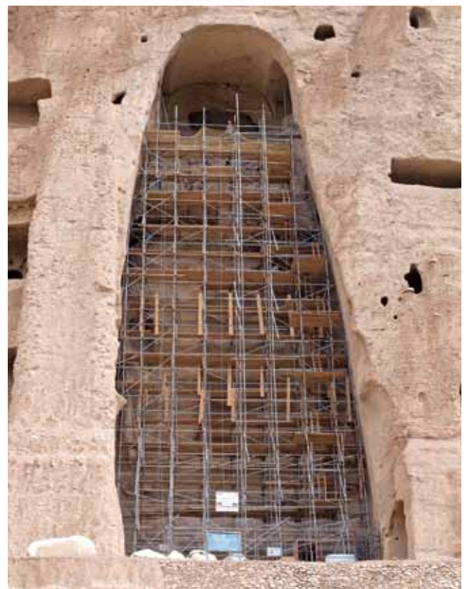
Niche of the Eastern Buddha with scaffolding

upper crossing. Not yet completed is the safeguarding of the visitor passage on the ground floor in front of the caves behind the feet of the statue. The Conservation and documentation of rock fragments (task 3) will continue to be an important responsibility. The documentation of the salvaged fragments in due consideration of