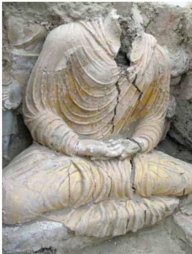
Bouddha en place